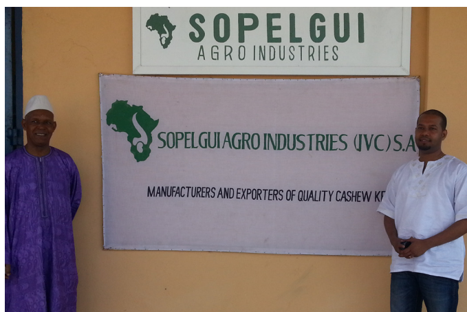
Sopolgui is Guinea's first cashew processor, and began operating in 2012.