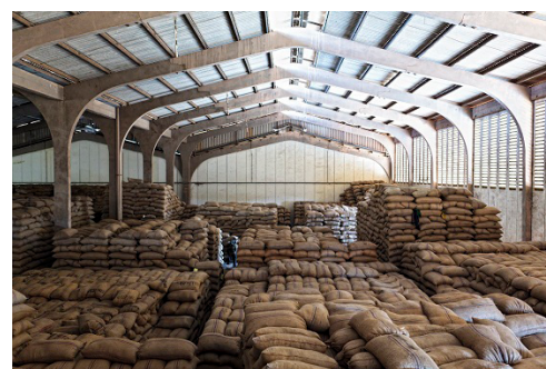
Government estimates of production in Ghana are 40,000 MT.

"The support will go to small holder farmers ... to enable them to increase their production levels to meet the target set and this support will come for them to start immediately this year", said Mr. Iddrisu as quoted in an article published April 6, 2013 in "The Daily Graphic" newspaper of Ghana.