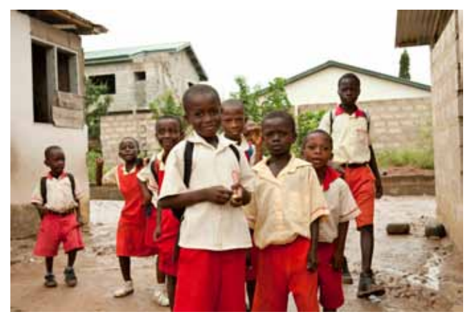
Students at the Afienya School located near the Winker cashew plant

A school project in Singapore. A cashew factory in Ghana. The two seem worlds apart. But thanks to the efforts of ACA, they have been connected.