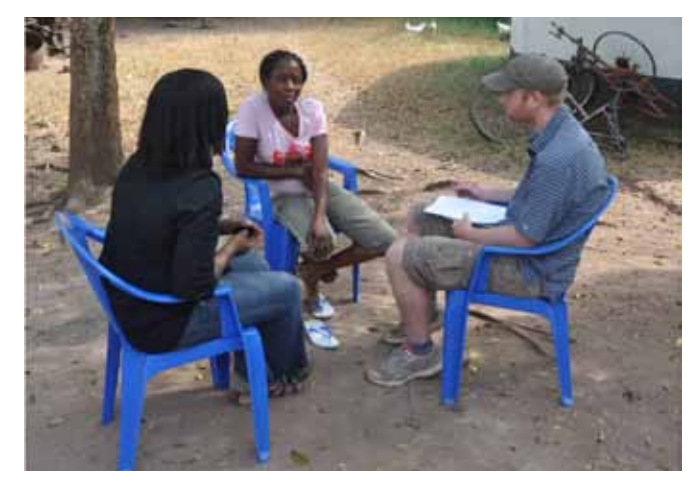
An ACi representative interviews a female cashew farmer from the Brong Ahafo Region in Ghana