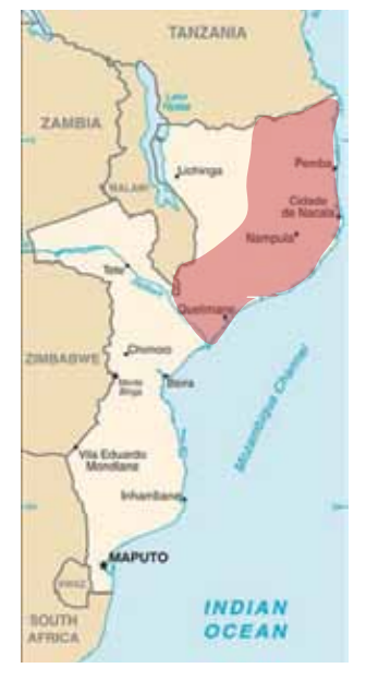
Mozambique's cashew producing regions located in the northeast of the country

Welcome to our new feature, Country Profiles. In each edition of the ACA Newsletter, we will profile a different cashew producing country in Africa. For our inaugural month, we'll look at MOZAMBIQUE, where the harvest is currently ongoing and exports are about to begin.