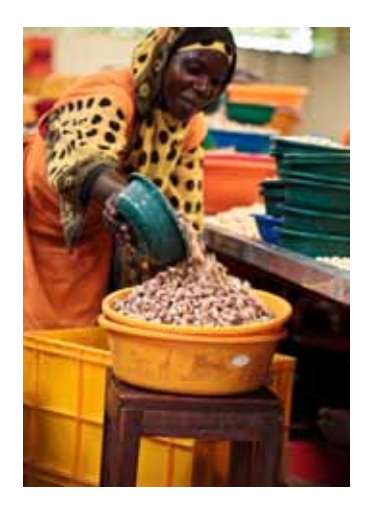
New investments in cashew processing create jobs for local women, such as this employee in

ACi studies relationship between cashew and female empowerment